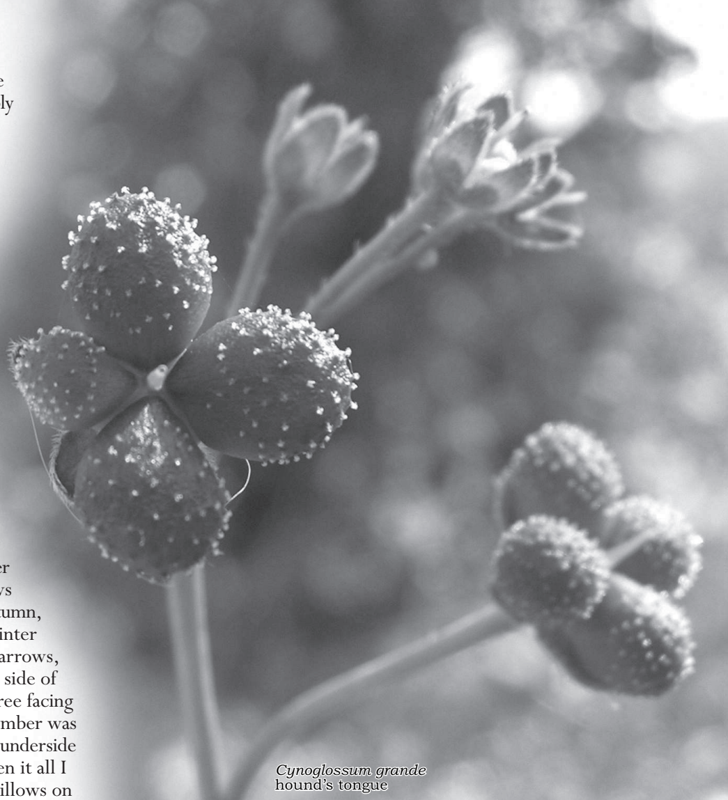
Cynoglossum grande hound's tongue