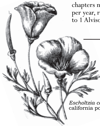
Escholtzia californica california poppy

Dues above the $12 for publications are tax deductible. You will receive the Yerba Buena News, the informative triannual journal Fremontia, and a statewide news bulletin. Members of other chapters may subscribe to the Yerba Buena News alone for $10 per year, renewable annually. Send a check made out to "CNPS" to 1 Alviso Court, Pacifica, CA 94044-4239.