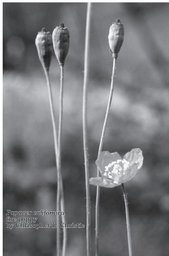
Papaver californica fire poppy